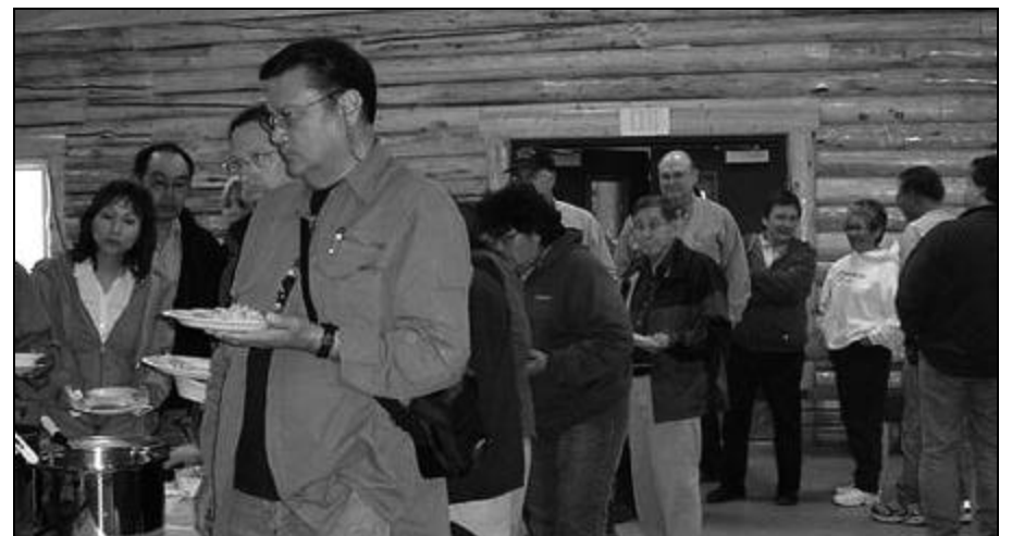
Villagers enjoy the Minto Clinic's grand opening potluck.

board member commented about this meeting, "[This was an] excellent opportunity for Board to expand exposure to our member organizations. [The] hospitality and arrangements were first class." Another stated, "[I'm] very grateful for the opportunity to come to Minto. People were very nice."