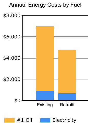
Figure 3.2 Annual Energy Costs by Fuel Type

Figure 3.3 below addresses only Space Heating costs. The figure shows how each heat loss component contributes to those costs; for example, the figure shows how much annual space heating cost is caused by the heat loss through the Walls/Doors. For each component, the space heating cost for the Existing building is shown (blue bar) and the space heating cost assuming all retrofits are implemented (yellow bar) are shown.