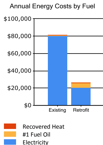
Figure 3.2 Annual Energy Costs by Fuel Type

Figure 3.3 below addresses only Space Heating costs. The figure shows how each heat loss component contributes to those costs; for example, the figure shows how much annual space heating cost is caused by the heat loss through the Walls/Doors. For each component, the space heating cost for the Existing building is shown (blue bar) and the space heating cost assuming all retrofits are implemented (yellow bar) are shown.