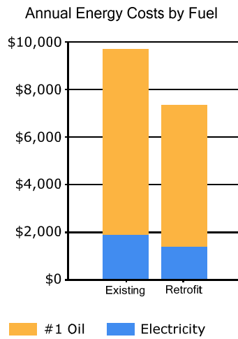
Figure 3.2 Annual Energy Costs by Fuel Type

Figure 3.3 below addresses only Space Heating costs. The figure shows how each heat loss component contributes to those costs; for example, the figure shows how much annual space heating cost is caused by the heat loss through the Walls/Doors. For each component, the space heating cost for the Existing building is shown (blue bar) and the space heating cost assuming all retrofits are implemented (yellow bar) are shown.