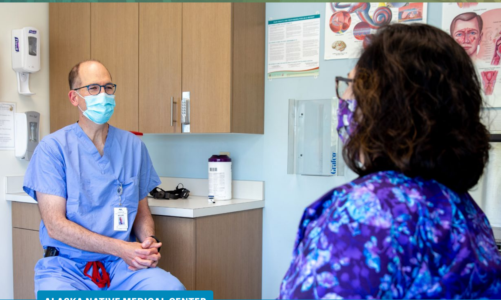
ALASKA NATIVE MEDICAL CENTER