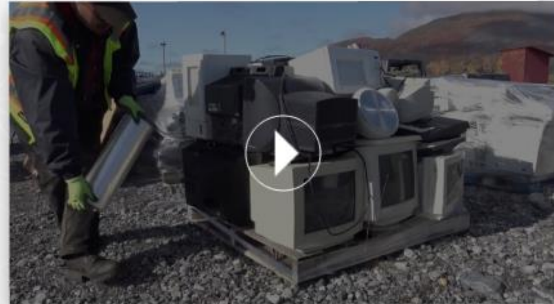
Overview of the Backhaul Alaska Program

Backhaul Alaska coordinates its removal — protecting subsistence resources, creating jobs, and removing toxins from the land we all call home.