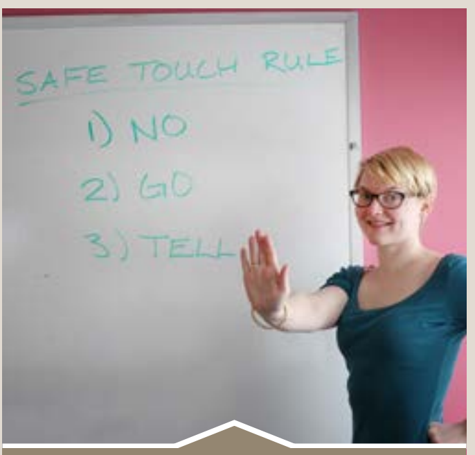
STAR educators offer child-friendly, developmentallyappropriate education that helps children understand safe versus unsafe touches, how to respond and get help, and that abuse is never their fault.