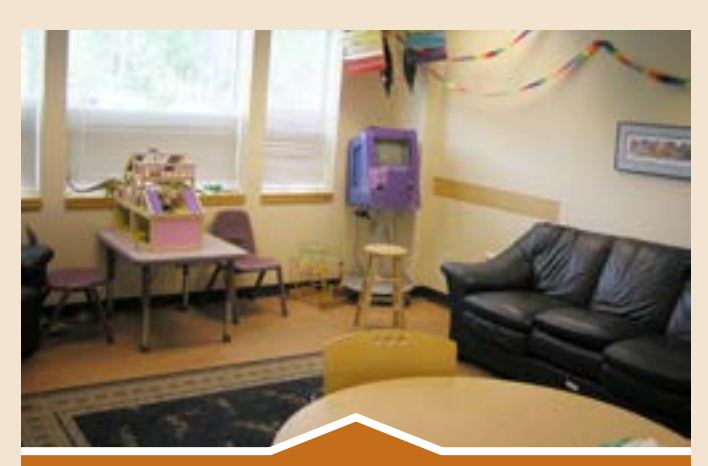
Alaska CARES provides a safe, family-friendly environment for the evaluation and investigation of children's exposure to violence. It is a place where children can tell their story and be believed, and where children and families can get the support