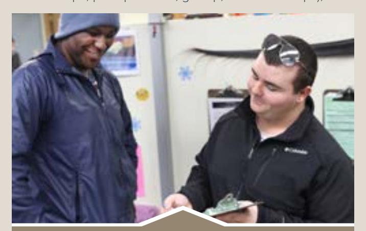
Youth receive services at the POWER Teen Clinic such as pregnancy and STI testing, condoms, counseling, peer support or they can go there to hang out with other youth. The clinic embraces youth of all backgrounds and works with organizations to help youth get the support they need.

Girls on the Run is a positive youth development program for 3rd-4th grade girls. Activities include running with volunteer coaches and a 5K run, an interactive curriculum (addressing issues such as understanding yourself, positive relationships, peer pressure, gossip, and friendships), media literacy, and community engagement.