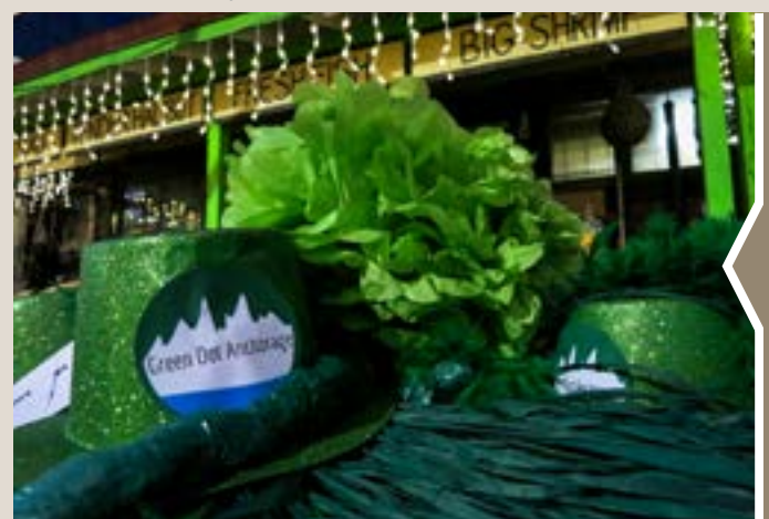
The Green Dot Initiative in Anchorage began with a community kick-off event. Green Dot is a bystander intervention approach based on the idea that every individual and every community can do something to prevent violence. Rather than prescribing what that something is, everyone is encouraged to think through how to intervene in a way that is safe and appropriate for them.

AWAIC's community-wide prevention strategies include: